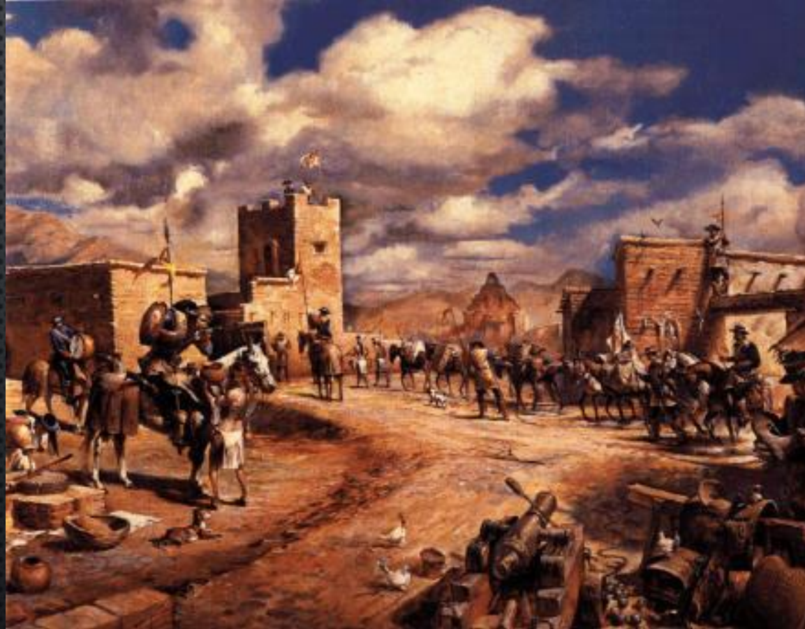
Painting of the Tubac Presidio, Arizona

To protect the missions, the Spanish built forts, called