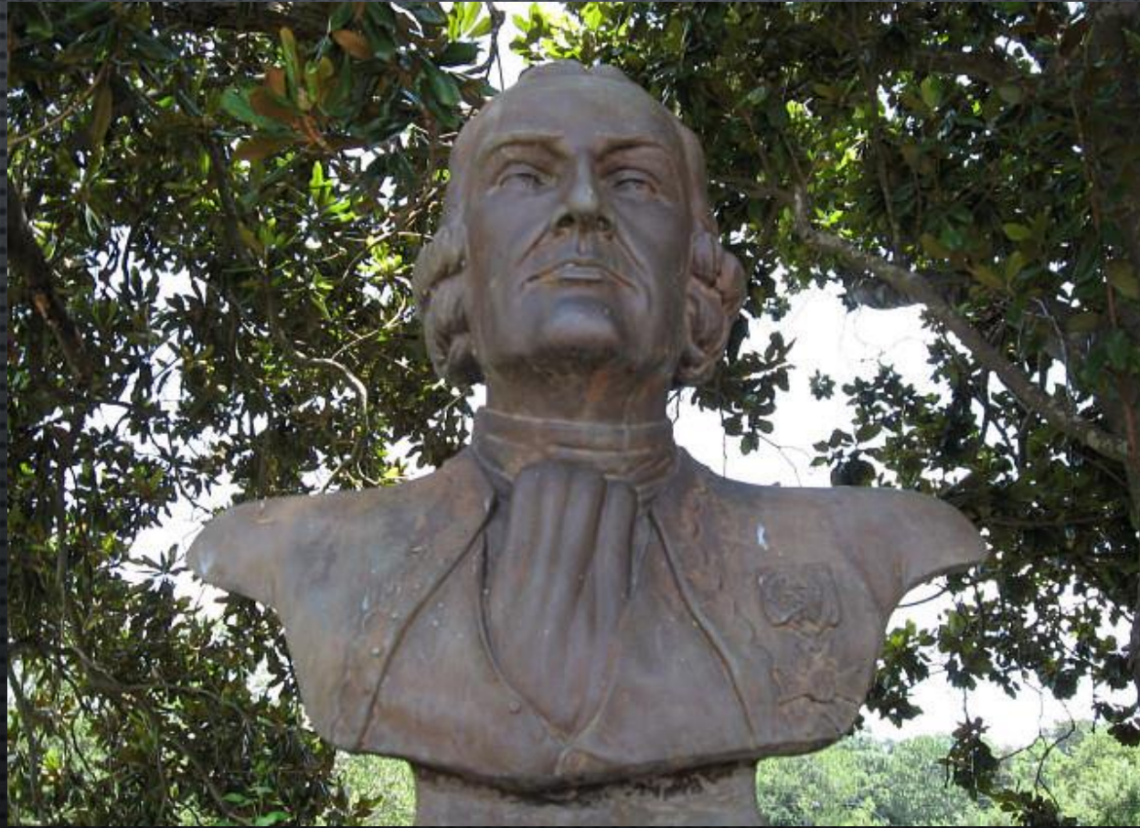
Monument to St. Denis in Natchitoches, Louisiana.

Why was Louis Juchereau de St. Denis important?