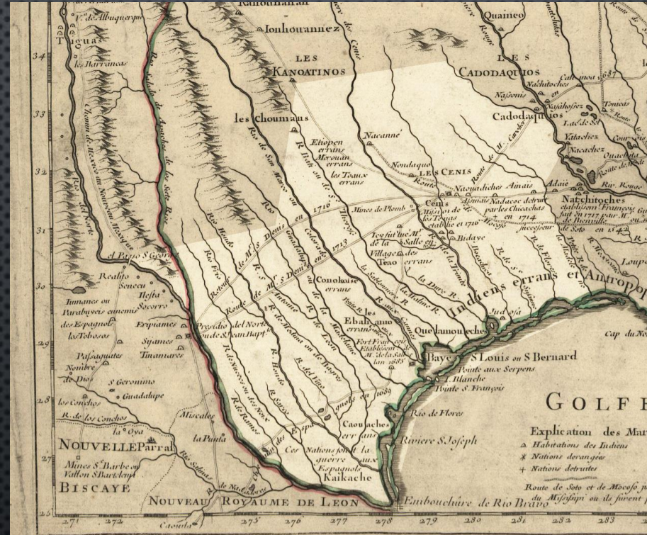
Map | Texas in 1718 by Guillaume de L'Isle

Why was San Antonio de Valero located where it was?