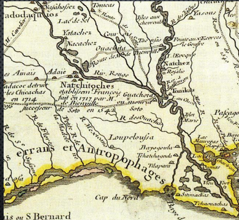
Detailed area | 1718 Map by Guillaume Delisle

Which mission town became the capital of East Texas?