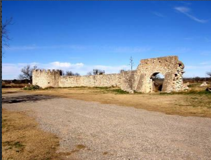
Presidio de San Saba ruins in Menard, Texas

Why did the Lipan Apaches want Santa Cruz de San Sabá built on Comanche land?