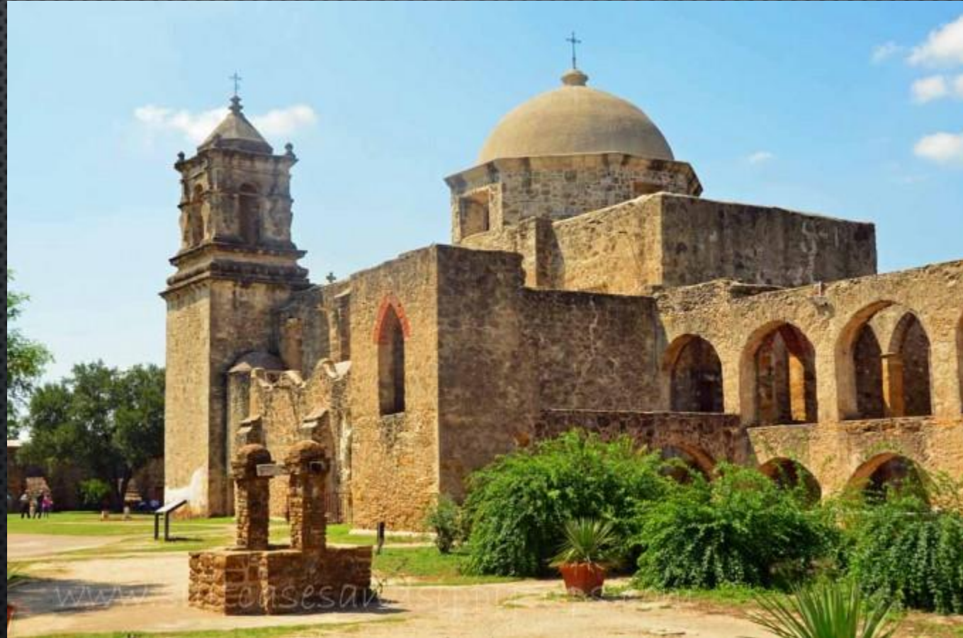
Mission San Jose San Antonio, Texas

The Spanish hoped to convert Native Americans by setting up